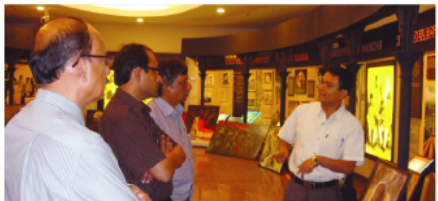
Tata official explaining history of Tata's CSR to the visiting team at the Centre for Excellence

sanitation, education, empowerment and environment in carrying out its CSR programmes. Tata Steel operates its CSR activities in 896 villages covering 18 districts of three states.