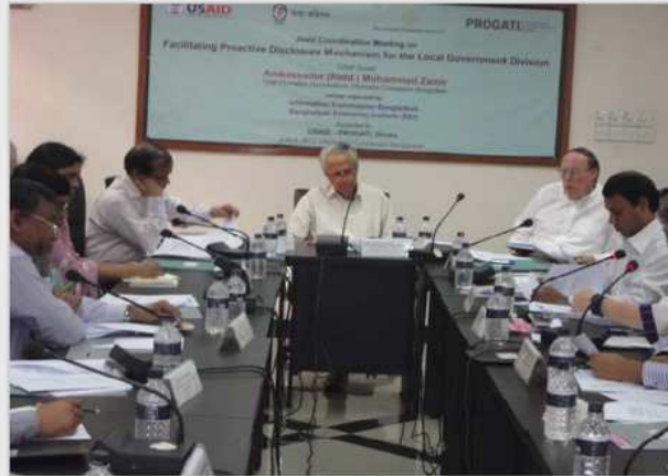
Second Joint Collaboration Meeting between the Information Commission and the LGD

developed their own disclosure policies and 30 of them have been approved by their Executive Committees. At the same time PROGATI, through its partner MRDI, is providing training to CSOs and the field level journalists on better understanding of RTI and on submitting RTI requests. After receiving training 26 RTI requests have been submitted by the journalists and 66 have been submitted by the CSOs.